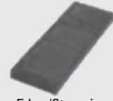
Edge/Step piece 600 x 200mm