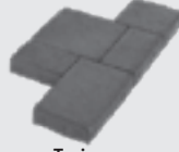
T piece 600 x 300mm