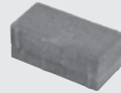
200 x 100 x 80mm