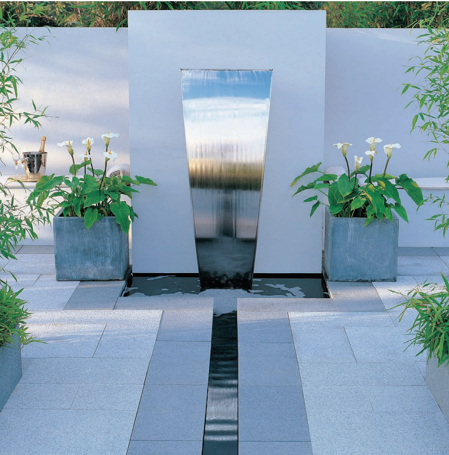
Arctic Granite Dusk